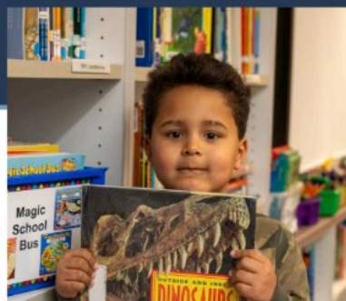
Goal 3: Whole Child