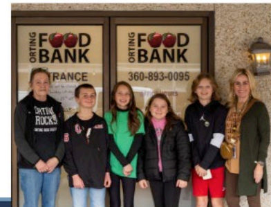
Goal 2: Community Partnership and Connection