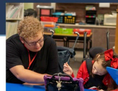
Goal 4: Student Support Systems