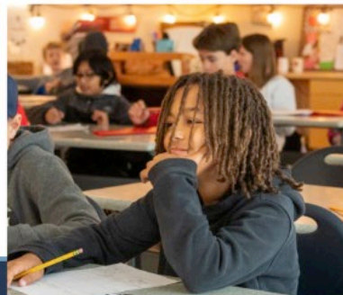
Goal 1: Academic Growth

Orting School District Strategic Goals: Benchmarks, Measures of Reporting, Monitoring Tools, and Frequency of Reporting